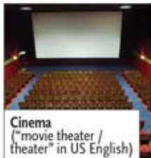
Cinema (“movie theater / theater” in US English)