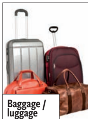
Baggage / luggage