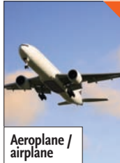
Aeroplane / airplane