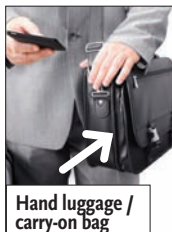
Hand luggage / carry-on bag