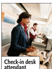
Check-in desk attendant