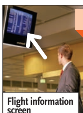
Flight information screen